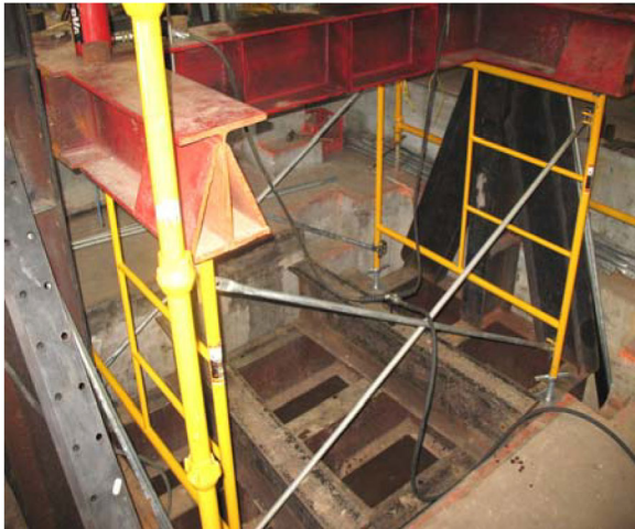
Single tier. Pre-load.