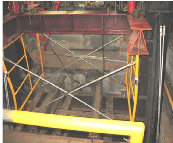
Single tier. Deflection at 81,820 lbs.

Our letters and reports are for the exclusive use of the client to whom they are addressed and shall not be reproduced except in full without the approval of the testing laboratory. The use of our name must receive our written approval. Our letters and reports apply only to the sample tested and/or inspected, and are not indicative of the quantities of apparently identical or similar products. Material submitted to our metals department will be discarded after a period of 30 days unless otherwise directed.