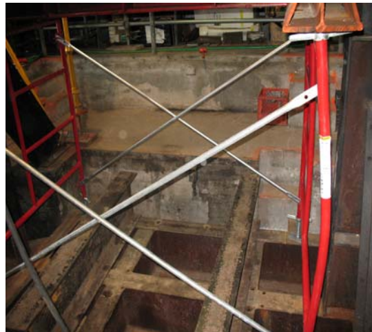
Single tier. Deflection at 73,750 lbs.

Our letters and reports are for the exclusive use of the client to whom they are addressed and shall not be reproduced except in full without the approval of the testing laboratory. The use of our name must receive our written approval. Our letters and reports apply only to the sample tested and/or inspected, and are not indicative of the quantities of apparently identical or similar products. Material submitted to our metals department will be discarded after a period of 30 days unless otherwise directed.