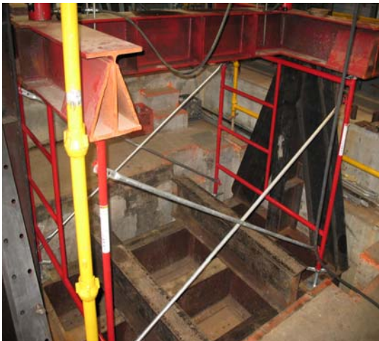
Single tier. Pre-load.